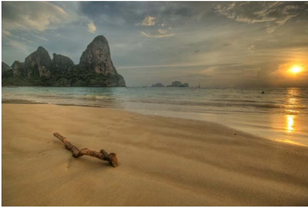
■ Ao Railay West Beach

■ Hat Noppharat Thara - Mu Ko Phi Phi National Park (อุทยานแห่งชาติหาดนพรัตน์ธารา - หมู่เกาะพีพี) Covering the areas of Tambon Nong Thale, Tambon Sai Thai, Tambon Ao Nang and Tambon Pak Nam, Amphoe Mueang, Hat Noppharat Thara - Mu Ko Phi Phi National Park has an area of 242,437 rai in which 200,849 rai is water. There are 3 distinctive kinds of forest here: moist evergreen forests, mangrove forests and peat swamp forests.