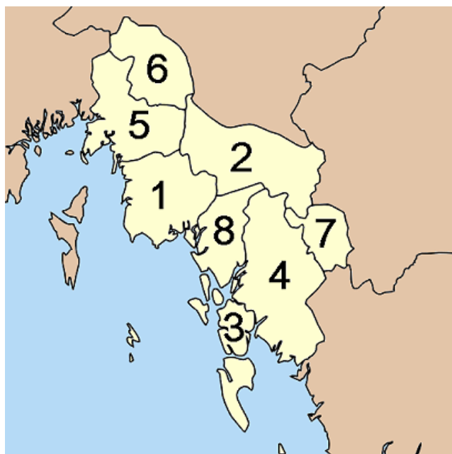
■ Map of Amphoe

Krabi is subdivided into 8 districts ( amphoe ), which are further divided into 53 communes ( tambon ) and 374 villages ( muban ).