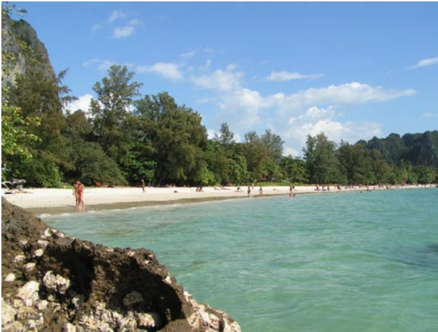
■ Railay Beach

Railay Beach (Thai – อ่าวไร่เลย์) is a small peninsula located between the city of Krabi and Ao Nang. Accessible only by boat due to the high limestone cliffs cutting off mainland access. These cliffs attract rock climbers from all over the world, but the area is also popular due to its beautiful beaches and quiet relaxing atmosphere. Accommodation ranges from inexpensive bungalows popular with backpackers and climbers, to the renowned jet-set resort of Rayavadee. The three main areas of Railay consist of West Railay, East Railay and Tonsai, with Tonsai catering more to climbers.