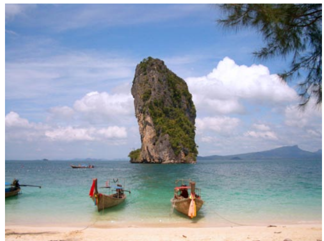
■ Ao Nang

Neighboring districts are (from the north clockwise) Ao Luek, Khao Phanom and Nuea Khlong. To the south and west borders the Phang Nga Bay.