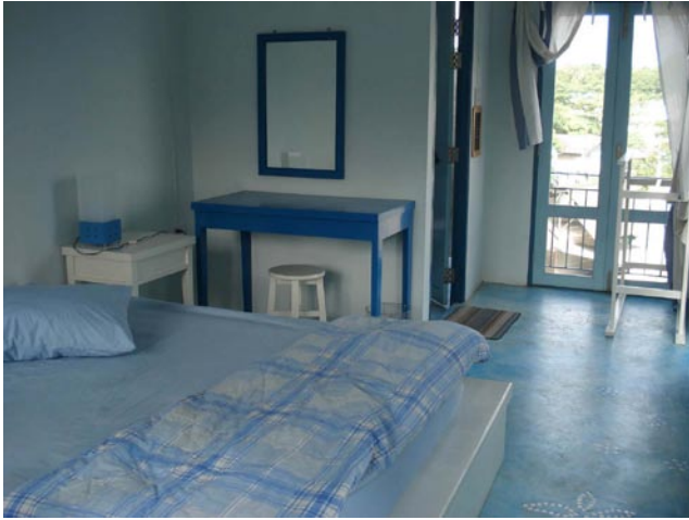
■ Chan Cha Lay hotel

rentals, mail and fax facilities, wireless internet and private parking.