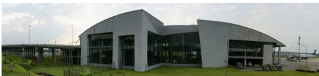
■ Krabi Airport